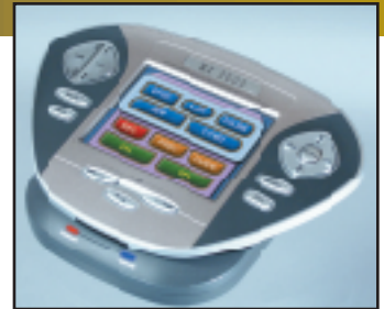
When not in use, the MX-3000 sits on its recharging cradle, which indicates a full charge with a blue LED.