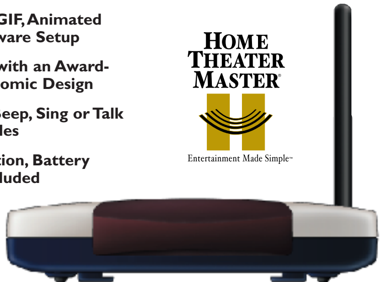
MRF-250 Radio Frequency (RF) Addressable Base Station